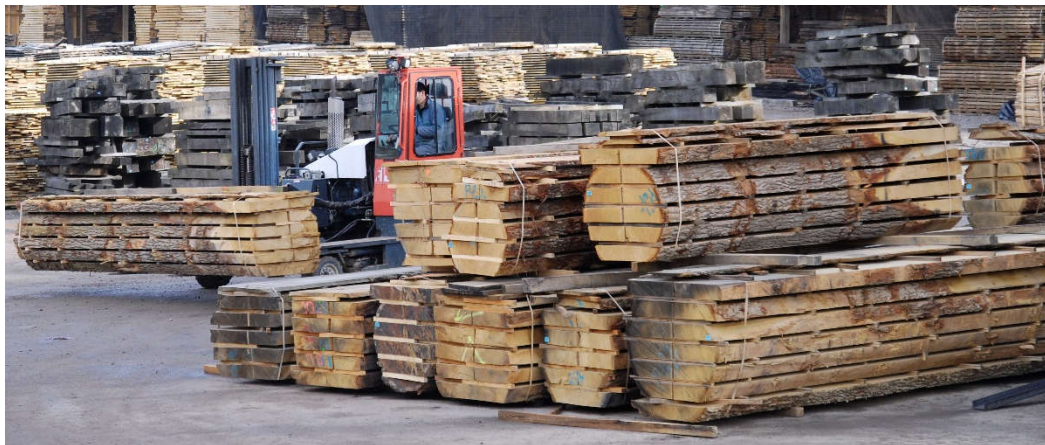
BOULES (QBA Kiln Dried)