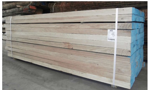
KD SQUARE EDGED 18mm to 100mm RIPPED TO WIDTH