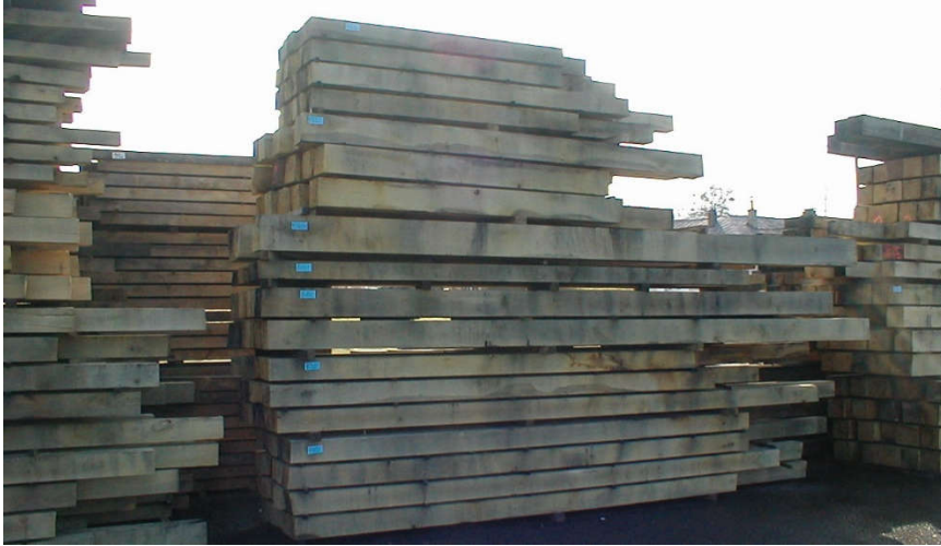
BEAMS (Fresh Sawn & Air Dried)