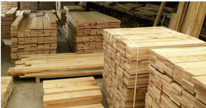
27mm KD BOARDS QF23x +